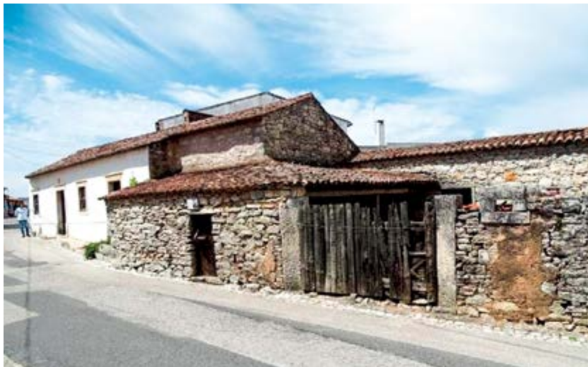
The house of the family of Francisco and Jacinta Marto

this divine plan, Francisco had the deepest possible understanding of the vision itself.